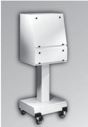
Note: Pedestal, plinth and casters shown in photo are optional.