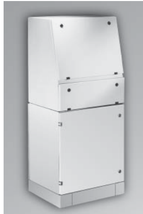
Note: Base and plinth shown in photo are optional.