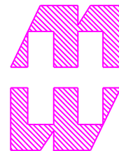
VIEW LID (INSIDE)