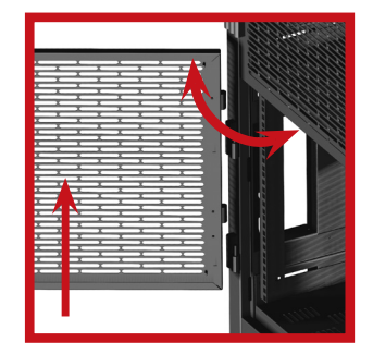
To remove doors; open and lift off.