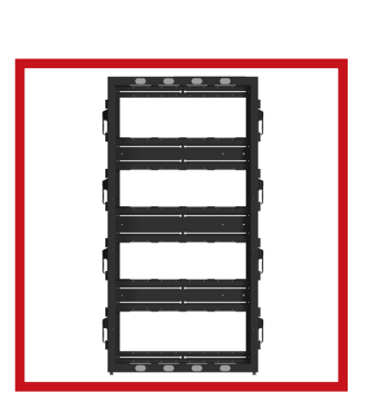
One frame fits all bay configurations. Easily pass cables between cabinets.