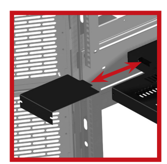
Easily remove cover panels to install a vertical PDU.†